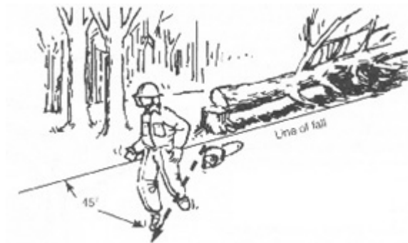
Figure 4: Maintaining an open escape route.

Make a safe work area by cleaning the ground around the base of the tree of limbs, underbrush, and other obstructions. Be sure to have an open pathway from the tree for an escape route when the tree begins to fall (Figure 4).