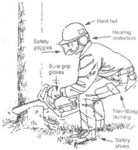
Figure 2. Personal protective equipment.

Make sure your saw is in top operating condition. Keep the chain properly sharpened. Follow manufacturer's recommendations for service and maintenance.