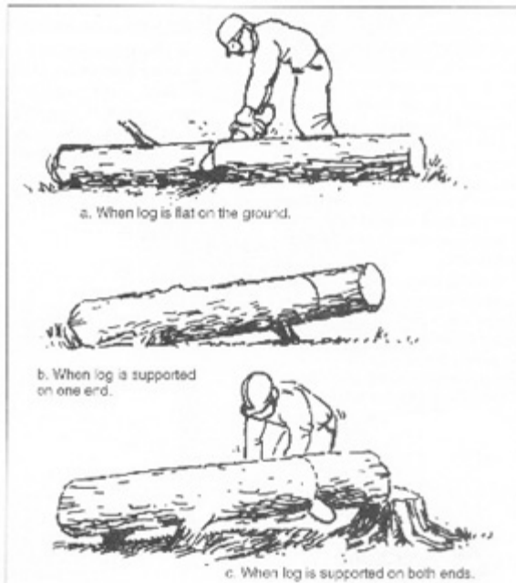
Figure 7. Bucking a tree.

When cutting firewood lengths, you can use several methods. One method is to make cuts about three-fourths of the way through for each length of firewood. Since the log is not cut completely through, several lengths will stay together and the log will remain rigid until all major sawing is completed. When you have made all cuts from one side, roll the log over and complete the cuts.