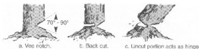
Figure 5: Notching a Tree