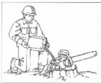
Figure 3. Fueling a saw.

Fuel your chain saw in well-ventilated areas, outdoors only (Figure 3). Always shut off the engine and allow it to cool before refueling. Relieve fuel tank pressure by loosening fuel cap slowly. If the chain saw is a 2-cycle engine, make sure fuel/oil mixture is correct.