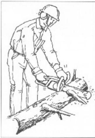
Figure 6: Cutting limbs on top first